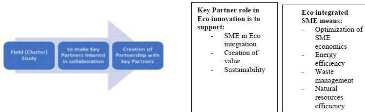
Diagram #2. The Stages of Communication Regarding Key Partnership for Eco Innovation in SME

For this purpose we have to develop the following, - How to make Key Partners join you for eco innovation in SME: